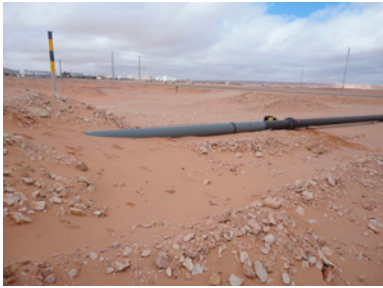
Location photo of typical road crossing

Here, a 30.5 cm (12 in) condensate line was buried at depths 1–2 m (3.3–6.6 ft) and areas of metal loss were identified for follow-up inspection.