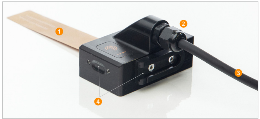
Figure 2: The P-Flex probe connected to its cable adapter.

To cover maximum inspection scenarios and offer the ideal compromise between coverage and detection performance, the P-Flex probes are available in three formats with different coil sizes: small, medium, and large. Selecting the right probe should be based on the smallest defect to detect, the required coverage of the array, and the nature of the material being inspected (ferromagnetic or not).