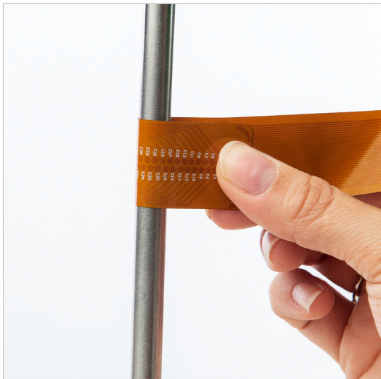
Figure 1: Thin ultra-flexible array of coil wrapped around a pipe.

With printed coil density at the forefront of current probe technology, the P-Flex offers a higher signal-to-noise ratio (SNR) and coil uniformity compared to other printed probes on the market. Powered by Eddyfi Technologies' SmartMUX and advanced multiplexing topologies, this probe family delivers an unrivaled probability of detection of small flaws.